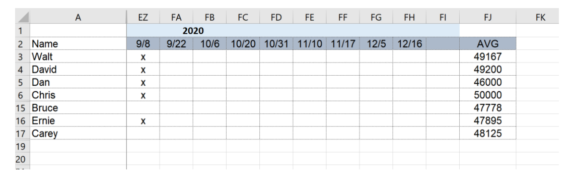
Step 2: Sort the list by 1) Session Date and 2) AVG (which is the cumulative average of points for an operator) in descending or 'Largest to Smallest' order