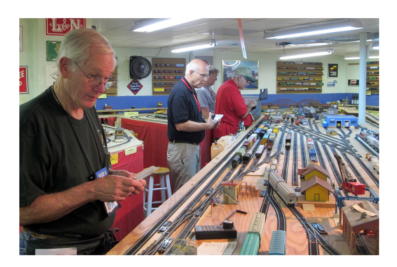
View of DH yard